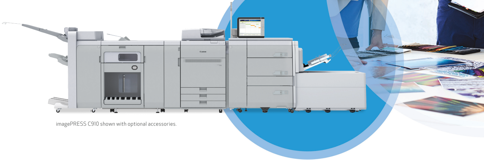
imagePRESS C910 shown with optional accessories.

Incorporated into this color digital press is Canon's passion and unique understanding of imaging, photography, color science, and workflow. This expertise has resulted in a high-quality digital press that's both productive and versatile for printing establishments of varying shapes and sizes.